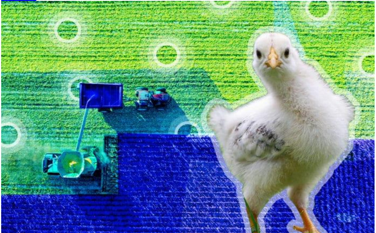
Illustration: © IoT For All

The Internet of Things (IoT) has provided not only a way to better measure and control growth factors, like irrigation and fertilizer, on a farm, it will change how we view agriculture in its entirety. In this article, I'll explain what exactly a smart farm is and IoT will impact the future of farming.